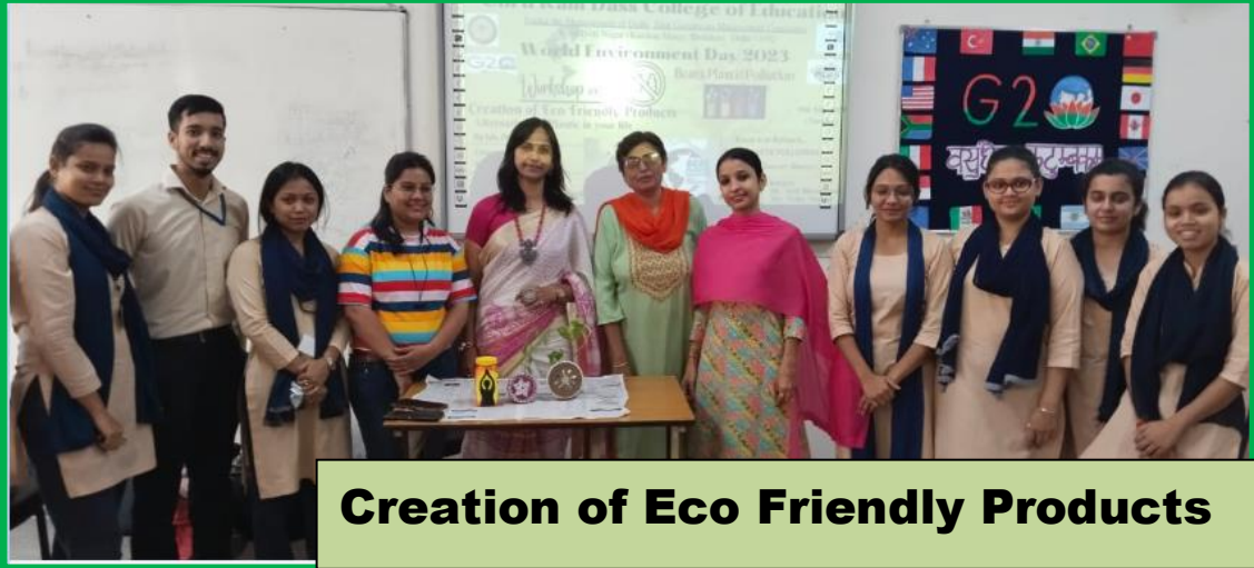
Creation of Eco Friendly Products